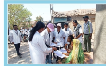
Health Awareness Program