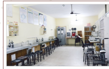
Department of Physiology & Bio Chemistry