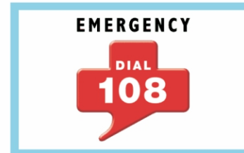
Campus Interview Job Placement