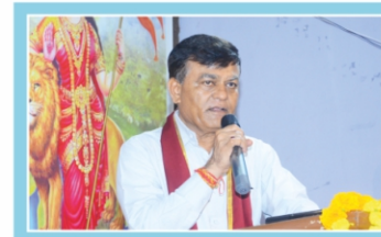
Campus Visit by Vice Chancellor of Saurashtra University