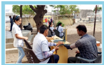
Health Checkup Camp