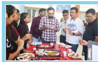
Millet year Celebration