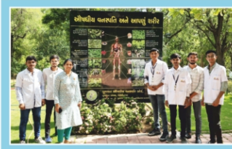
State Government Herbal Garden