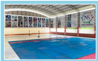
Indoor Sports Complex