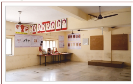
Department of Gynaecology & Obstetrics