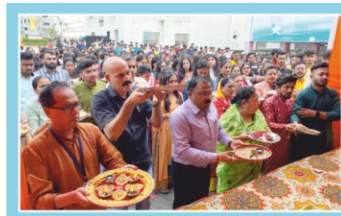
Ganesh Pooja Celebration