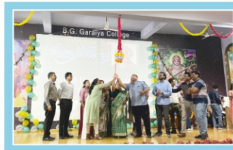
Celebration on World Homoeopathy day