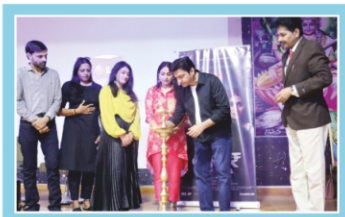
Promotional program by Bollywood celebrities