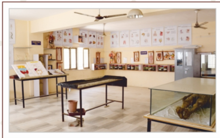
Department of Anatomy