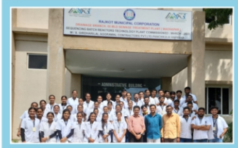
Sewage Treatment Plant Visit