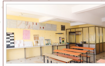
Department of Surgery