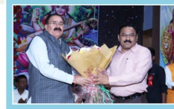
Campus Visit by Shri Rambhai Mokariya (MP)