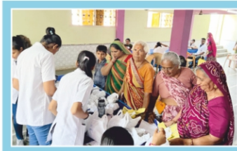
Health Awareness Camp