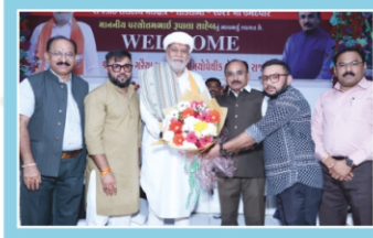
Campus Visit by Shri Parshottam Rupala (MP)