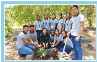
Tree Plantation on World Environment day