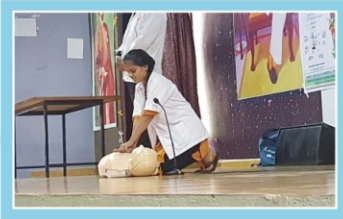
Cardiopulmonary Resuscitation Demonstration