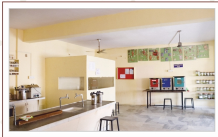
Department of Pathology & Microbiology