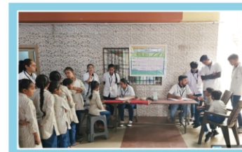
School Health Checkup Camp