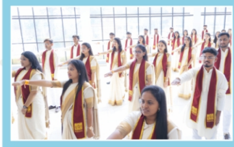
Degree Oath ceremony