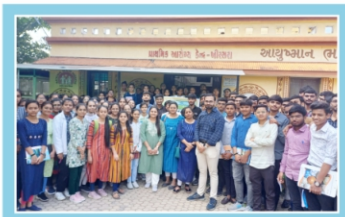
PHC Centre Visit