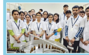
Heal Well Pharmaceutical Company