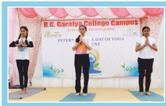
Yoga day celebration