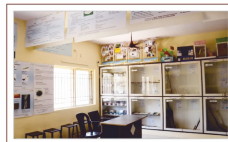
Department of Forensic Medicine and Toxicology