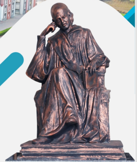
Dr. Samuel Hahnemann

Recognized By:- Ministry Of AYUSH & National Commission for Homoeopathy, New Delhi. Affiliated to Saurashtra University-Rajkot