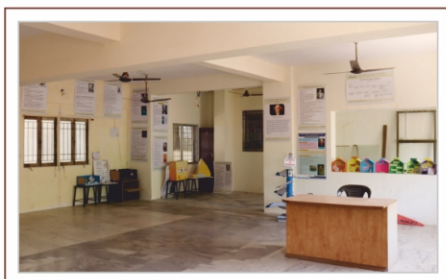
Department of Organon of Medicine & Philosophy (UG/PG)