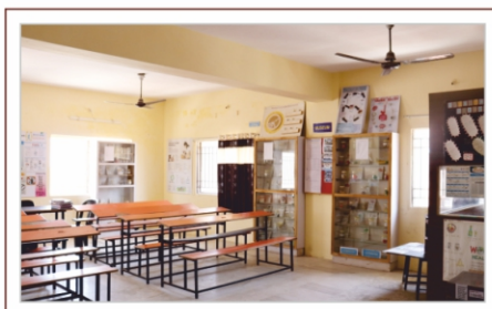
Department of Community Medicine