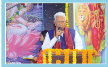
Campus Visit By Shri Vajubhi vala (Ex Governer)