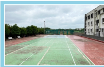
Outdoor Sports Complex