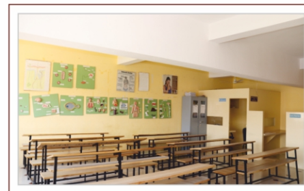
Department of Practice of Medicine