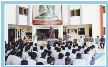
Celebration on World Homoeopathy day