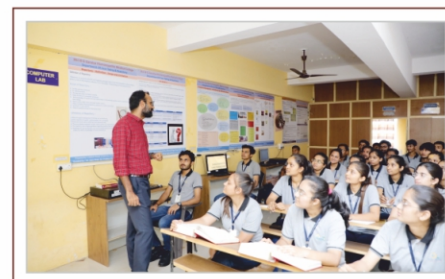
Department of Repertory & Case taking (UG/PG)