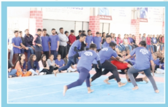
Celebration of Sports Week